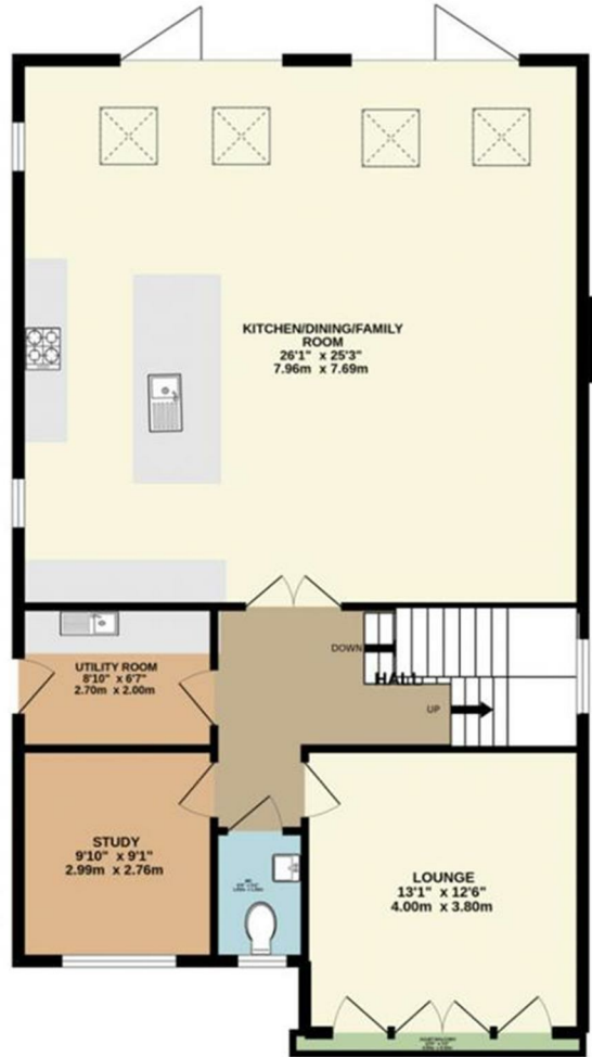
RAISED GROUND FLOOR 1129 sq.ft. (104.9 sq.m.) approx.